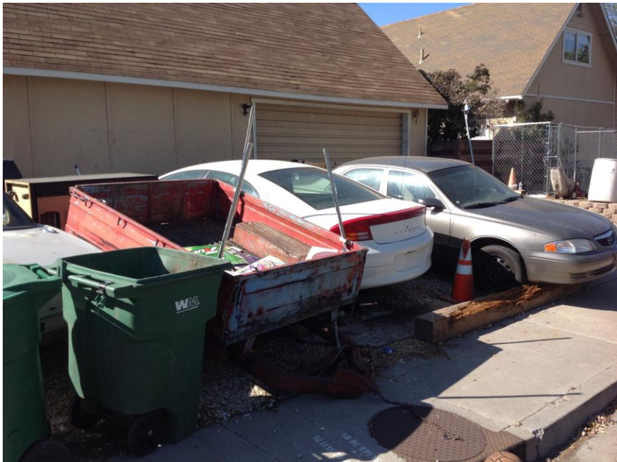
Visible vehicle storage in a side yard